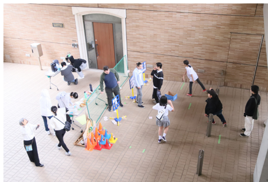
Games for children