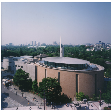
Present Church in its initial years

The theme consists of three elements: " Walk Together ," " Toward the 25th Anniversary ," and " Beyond ". "Walk Together" pertains to the spirit of the Synod. "Toward the 25th Anniversary" refers to the beginning of the dedication of the present church 25 years ago. Beginning from the launching on October 8,