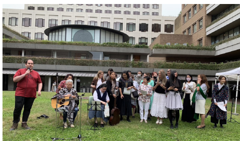
Spanish Group singing, Enciendeme