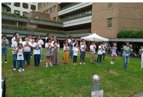
English Sunday School Performance