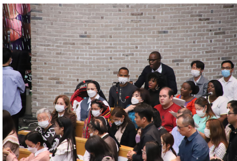
Choir consisting of different language groups

While the Mass was celebrated in Japanese, various parts were done in other languages, reflecting the plurality of the congregation and the richness of the liturgical expressions. The Readings were proclaimed in Bahasa (Indonesian) and Polish, respectively; the Responsorial Psalm was sung in Vietnamese, and the Gospel was read in Japanese. The General Intercessions were in seven languages, while the Creed and the Lord’s Prayer were recited in each one’s native tongue.