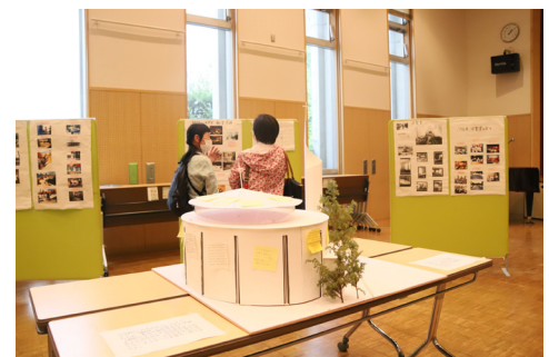
Exhibit in St. Joseph Hall

After the International Mass, Saint Joseph Hall was quickly transformed into a gallery divided into different sections displaying colourful visuals: the Japanese Sunday School children’s drawings celebrating St Ignatius Church’s 25th anniversary; the designs submitted for the 25th Anniversary Logo, coffee table books on the old and new church, and enlarged photographs of the Parish’s important events, visits, and celebrations. Most interesting were photographs telling the story of Saint Ignatius Church’s construction – from planning to completion - its transition from the old wooden church to the one standing at present. Also shown were the symbols and brief descriptions of the 12 Pillars of the Church corresponding to the twelve Apostles.