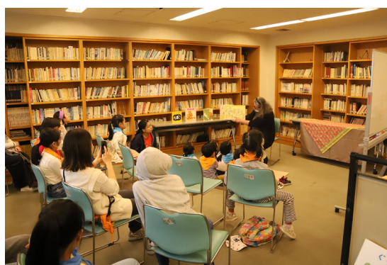
Children Reading activity